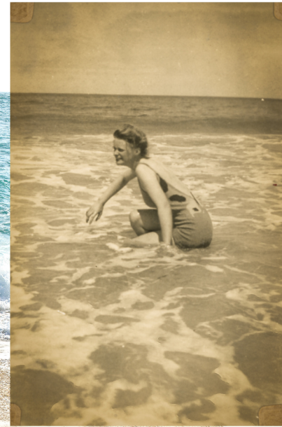
Before she grew old