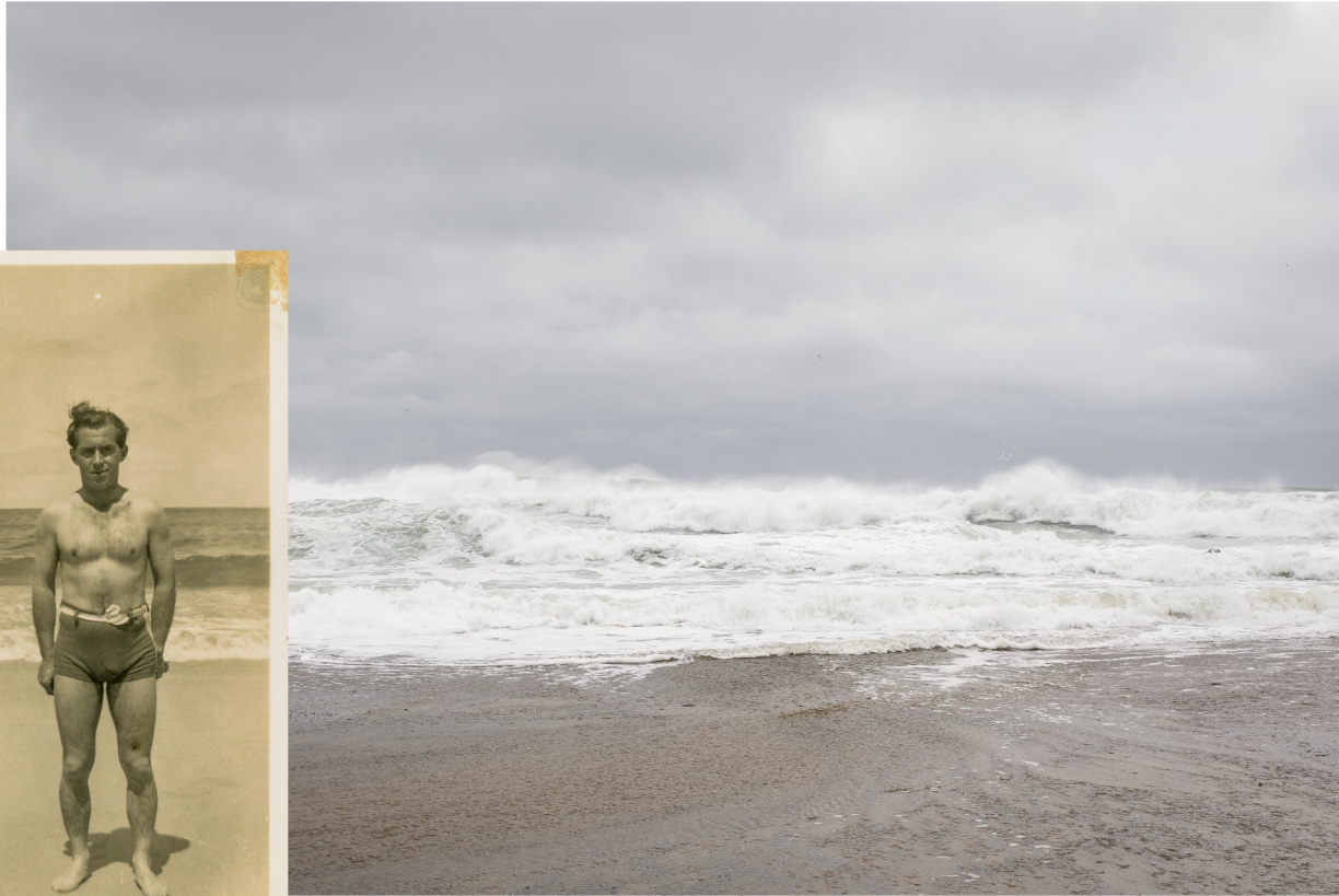
When he was young