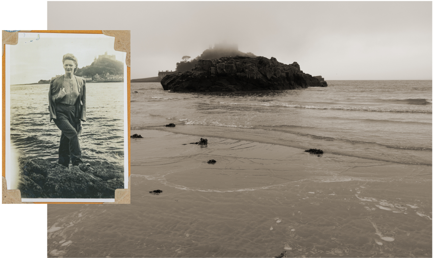
I miss her stories