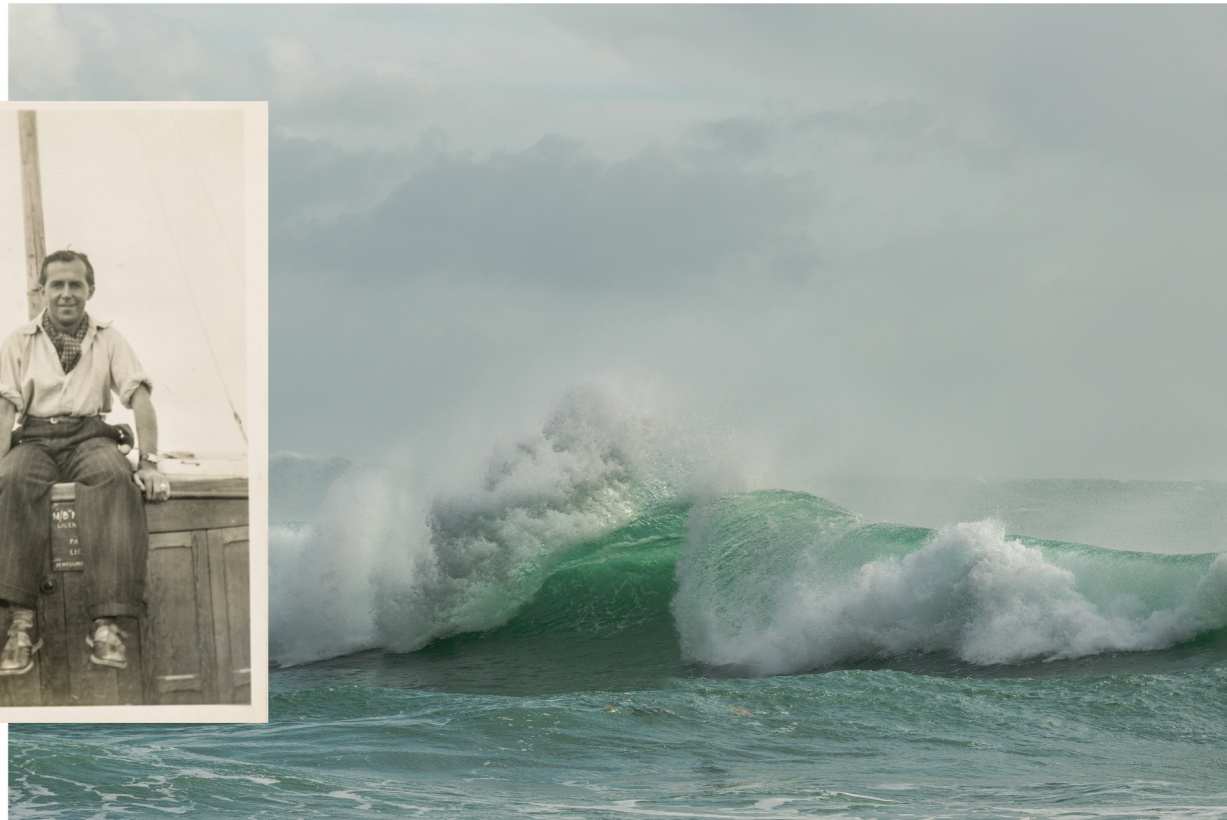
His eyes were the colour of the sea