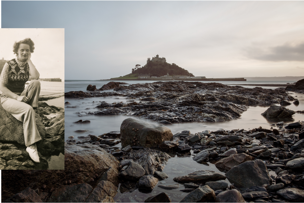
It will always remind me of her