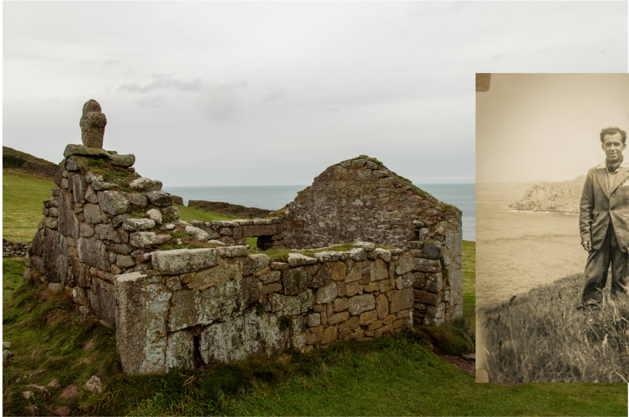
I wish time could stand still