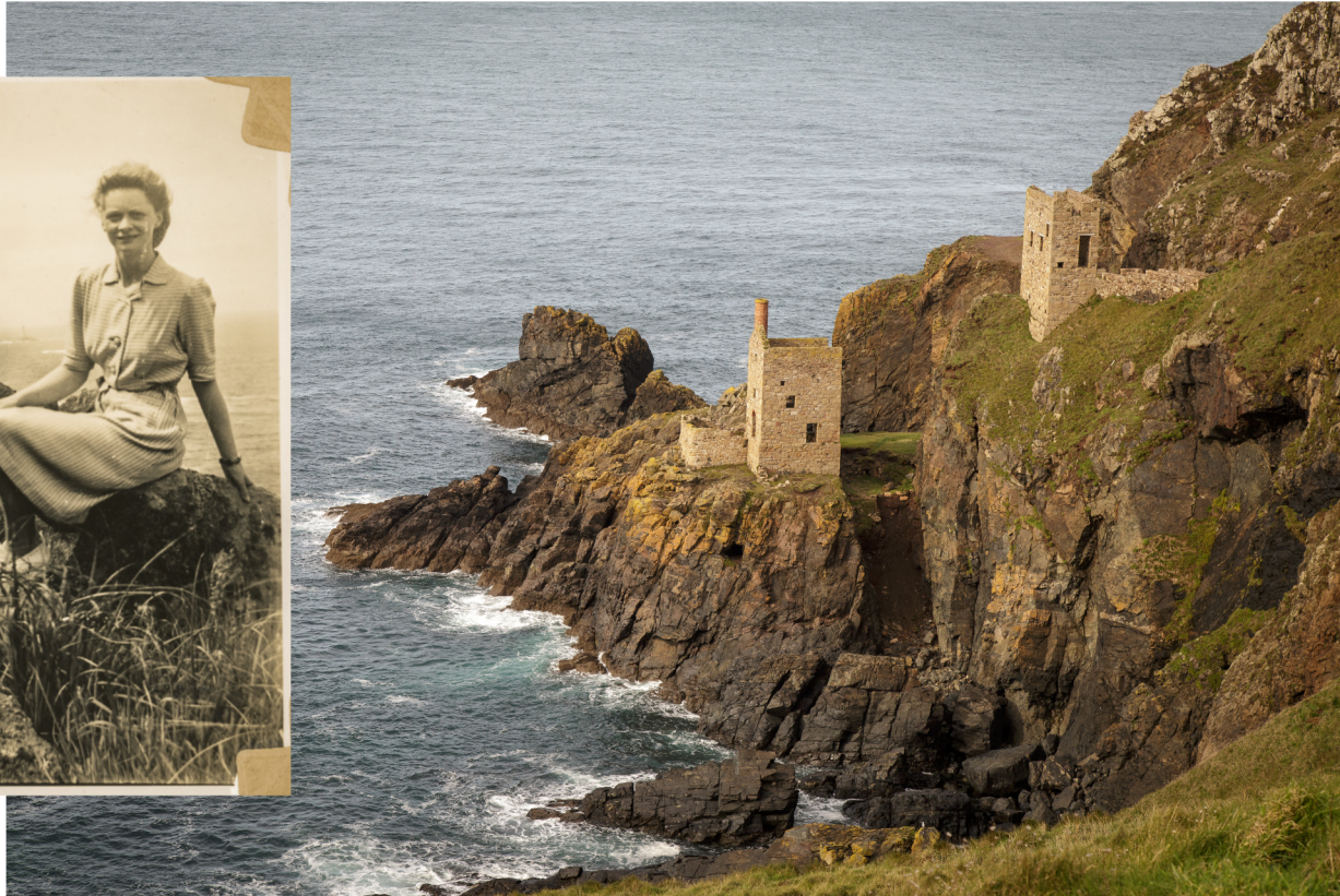
Before she was grandma