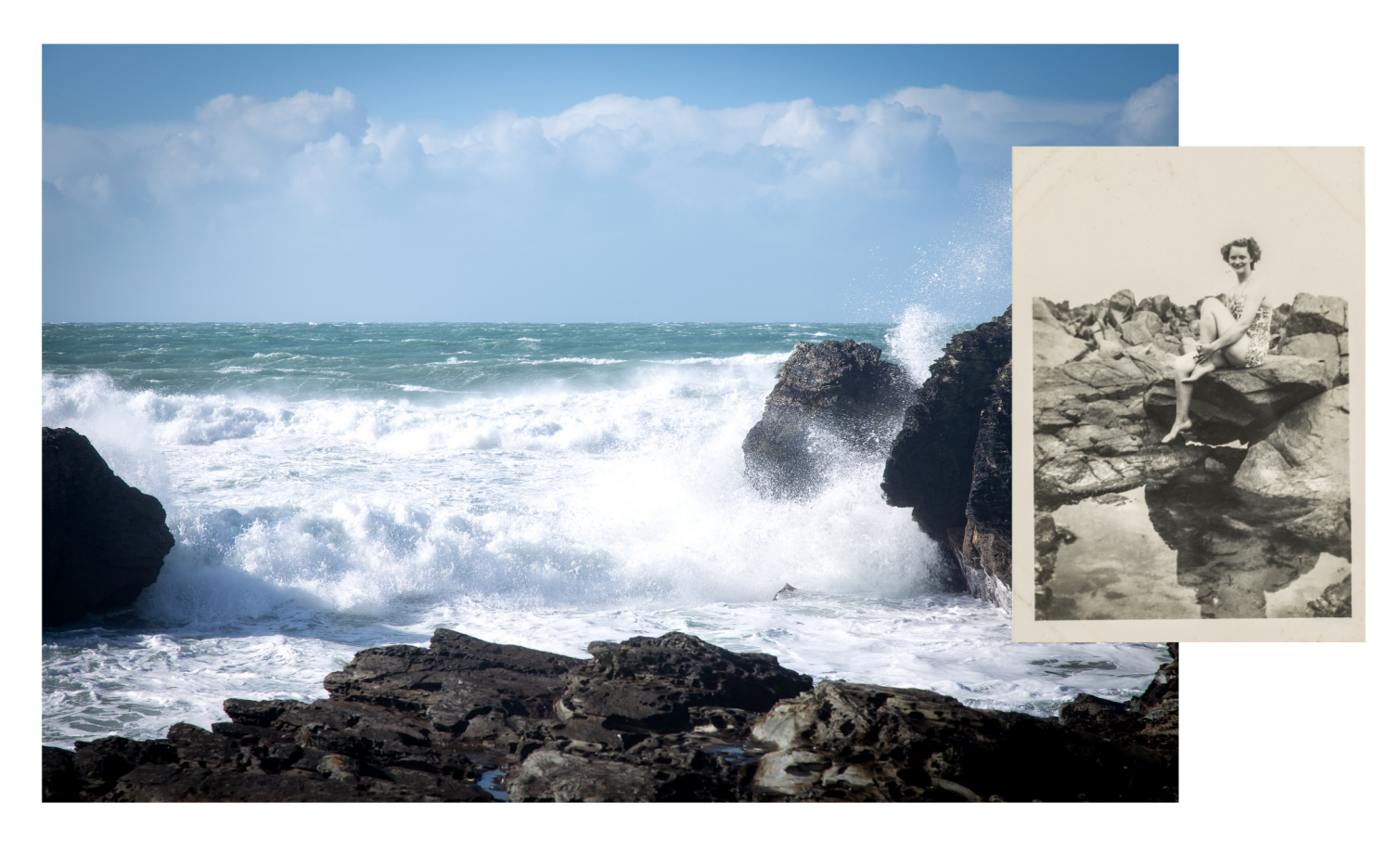
Nothing changes but everything changes