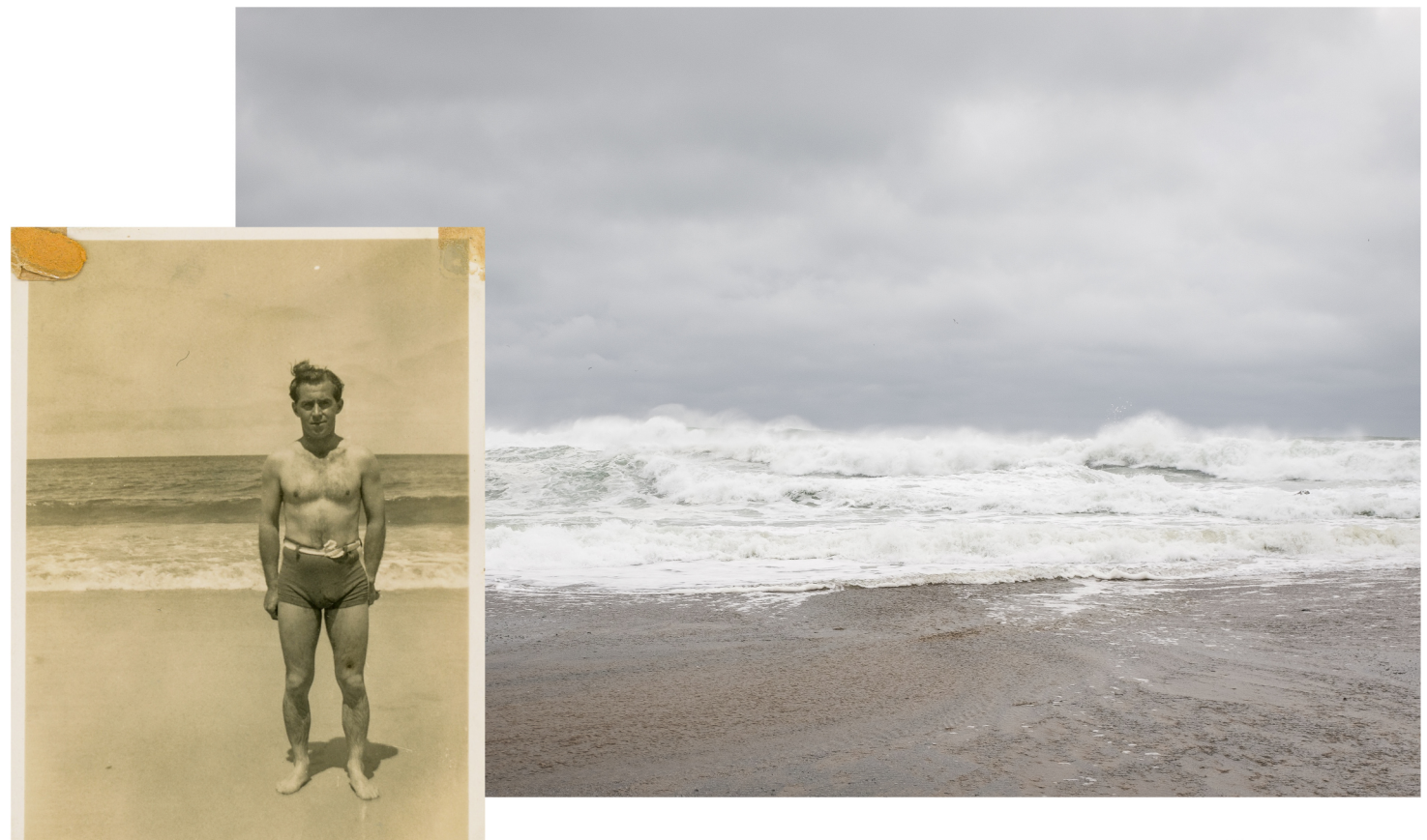
When he was young