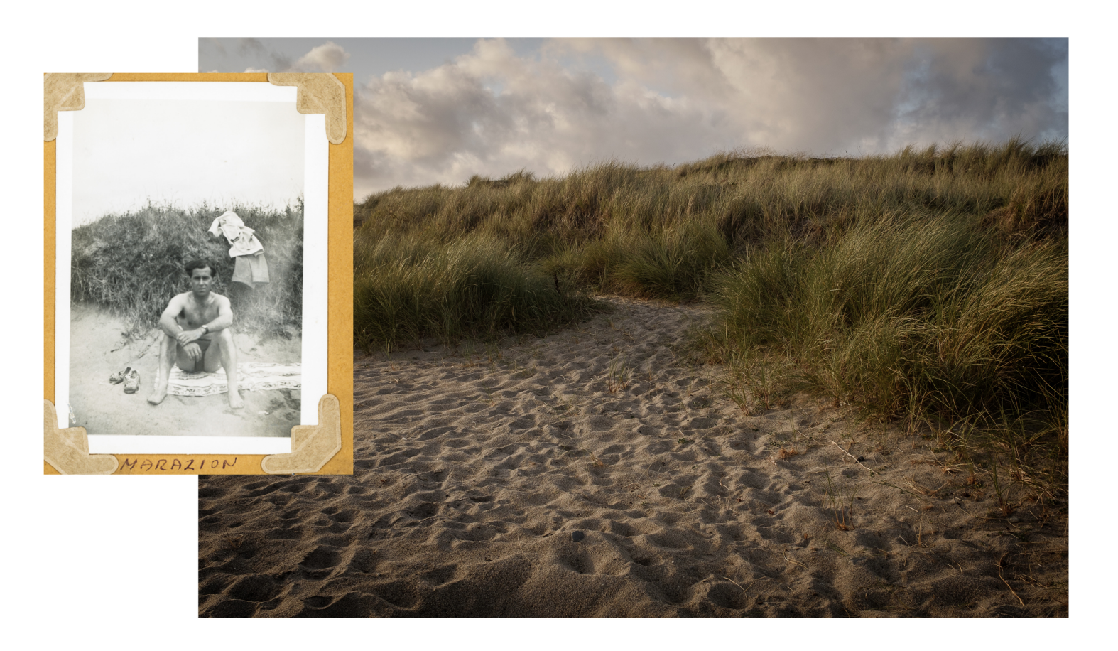
Empty spaces remind me of you