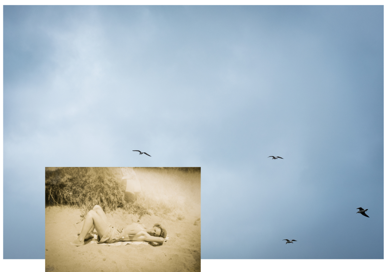
The sky was always blue