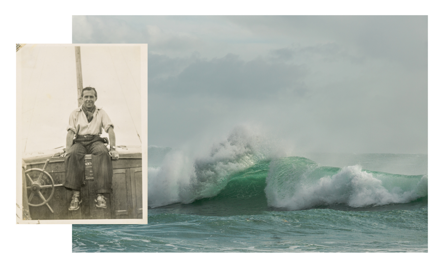
His eyes were the colour of the sea