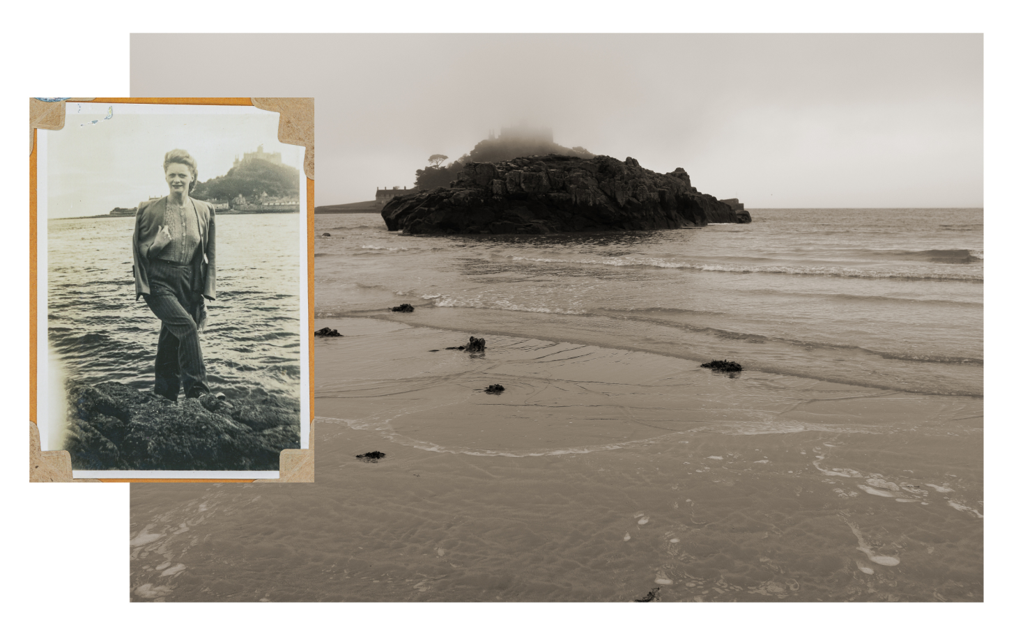
l miss her stories