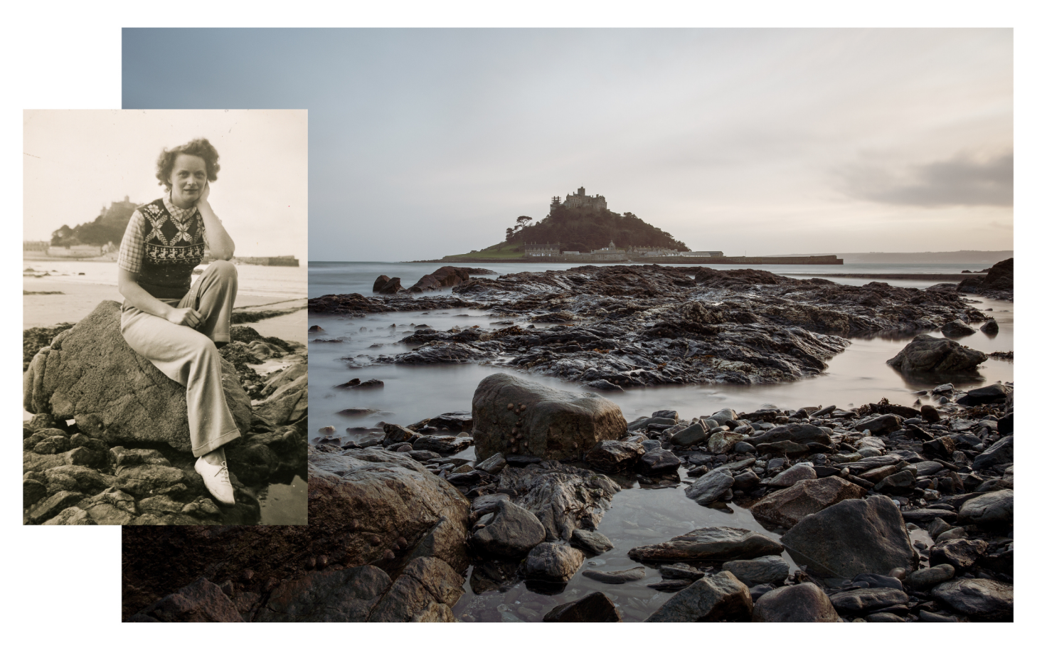
It will always remind me of her