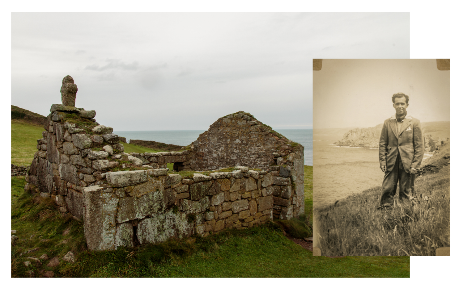
I wish time could stand still