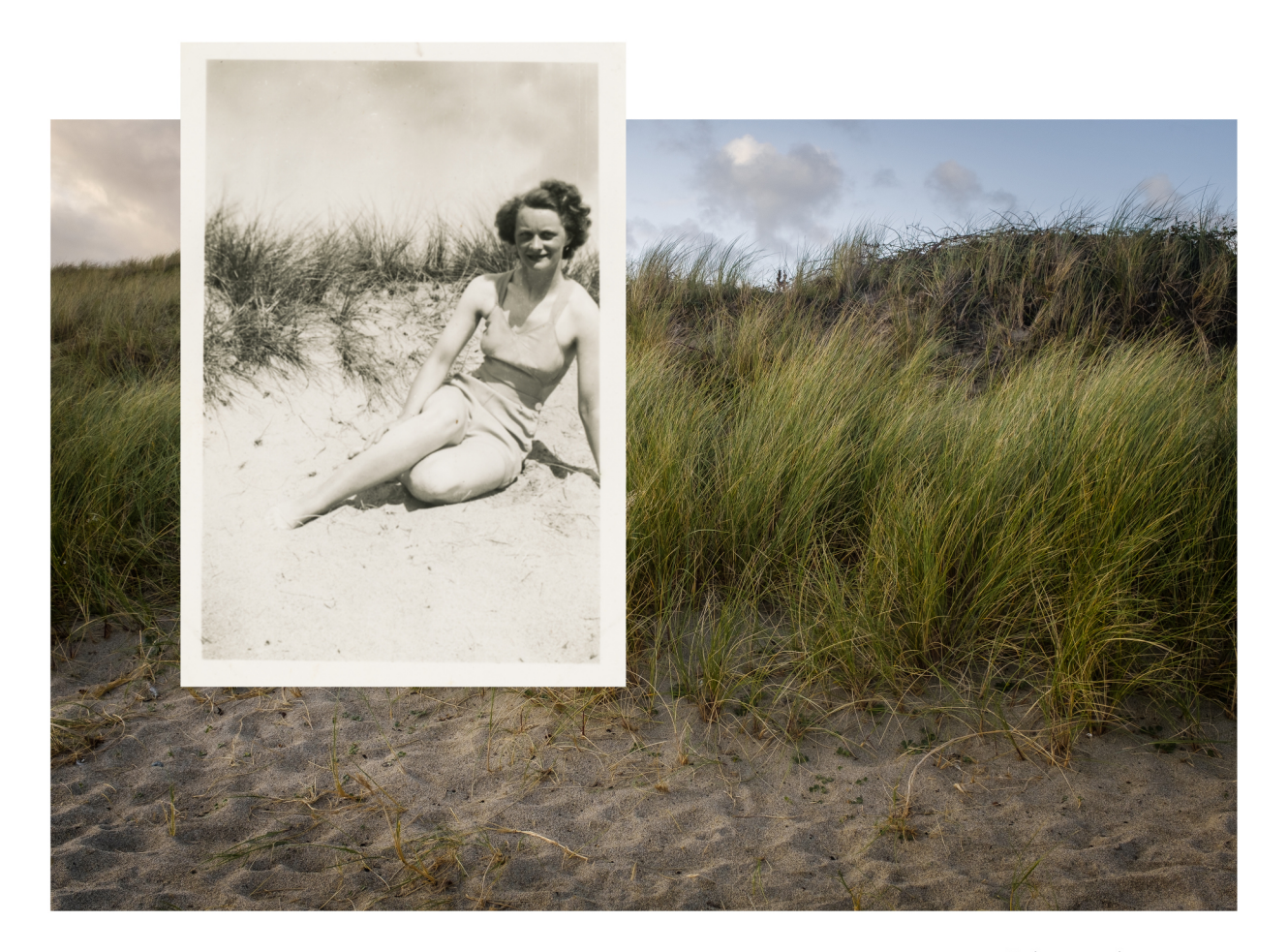
Wish you were here