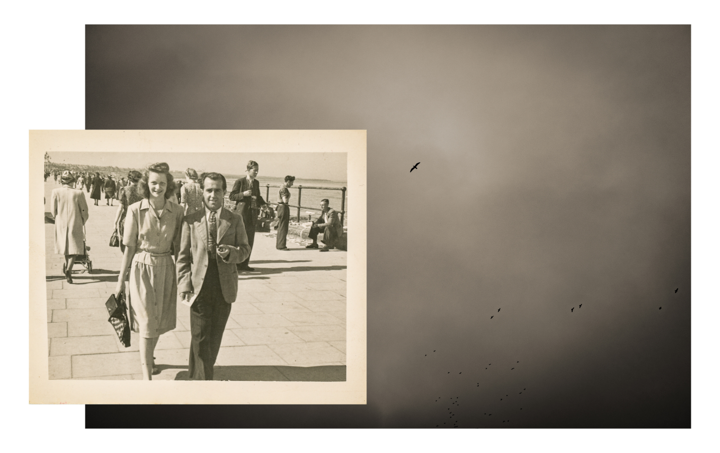
When the world was black and white