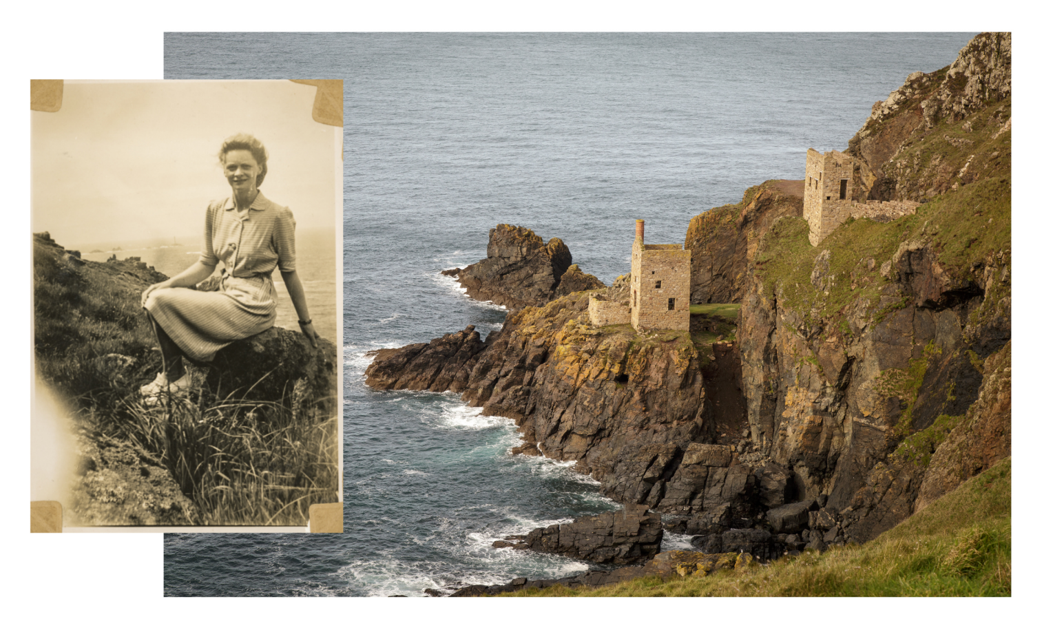
Before she was grandma